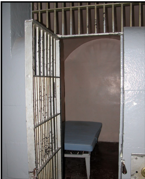
Death Row Cell—Ottawa Jail

The face becomes engorged and turns blue due