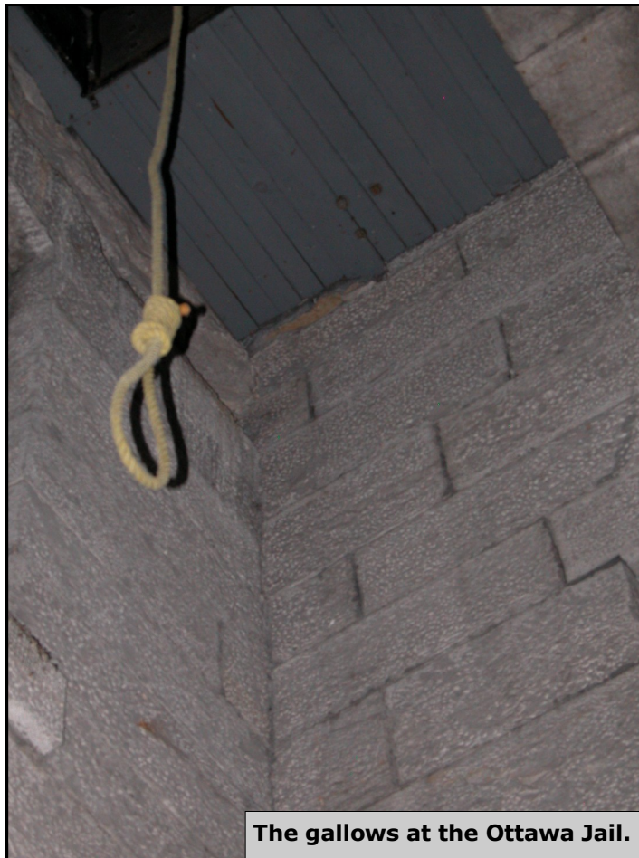
The gallows at the Ottawa Jail.

With the knot of the noose placed at the left side of the neck under the jaw, the jolt to the neck at the end of the